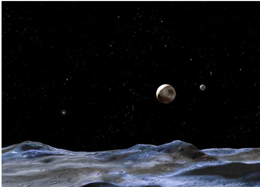
This artist's rendering shows how Pluto and two of its possible three moons might look from the surface of the third moon.